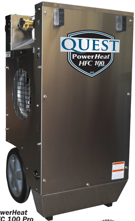
PowerHeat HFC 100 Pro